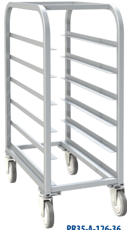
PR35-A-126-36 Half-size, for 12" x 30" Platters

Choice exclusive Base Structure for rigidity and stability