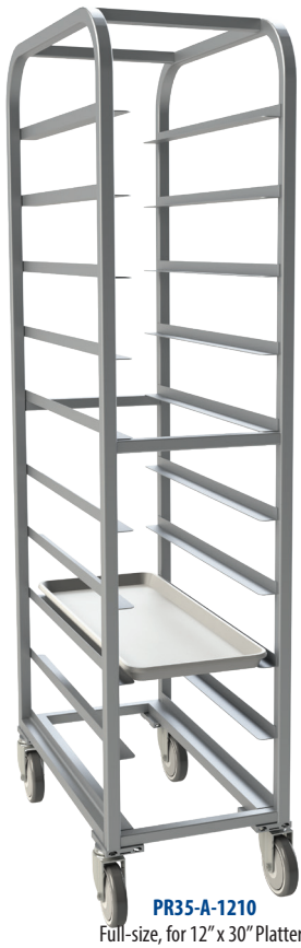
PR35-A-1210 Full-size, for 12" x 30" Platters

Patented Off-Set King Pin Caster for Increased Stability